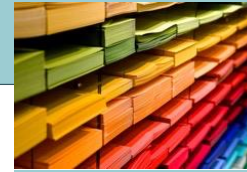
master data management