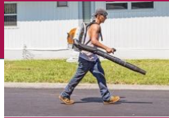
supplier service sheets